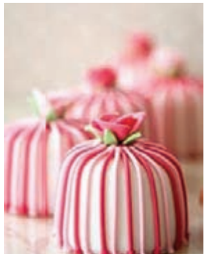
Lace Shop Paris