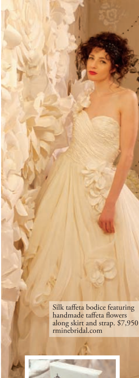
Silk taffeta bodice featuring handmade taffeta flowers along skirt and strap. $7,950 rminebridal.com