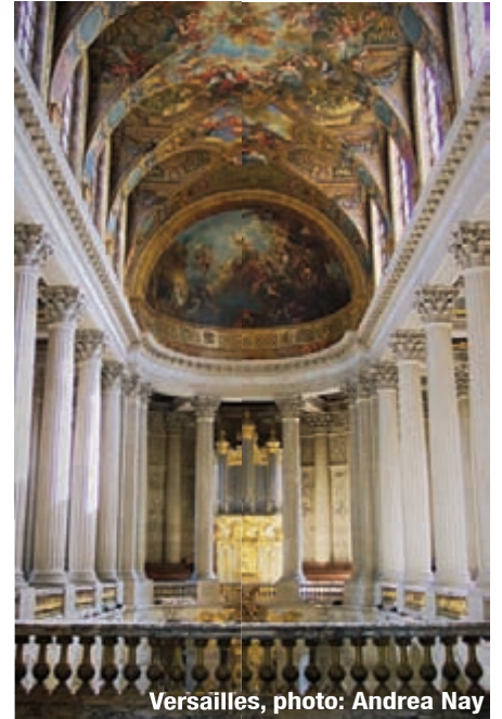
Versailles